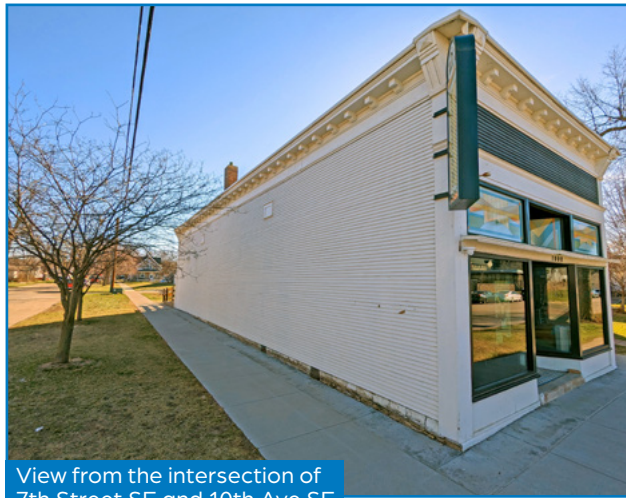
View from the intersection of 7th Street SE and 10th Ave SE