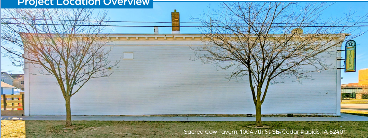
Sacred Cow Tavern, 1004 7th St SE, Cedar Rapids, IA 52401

Sacred Cow Tavern has burst into the restaurant and bar scene in Cedar Rapids as a popular neighborhood spot with a diverse crowd of patrons since its opening on October 31, 2022. The 1909 building that houses Sacred Cow Tavern is in a prime location, right on the perimeter of the Downtown District, MedQ, and NewBo neighborhoods. Next door is the newly constructed Linn County Public Health building and The Society of St. Vincent de Paul building. Sacred Cow Tavern will be a popular gathering spot for the community for years to come.