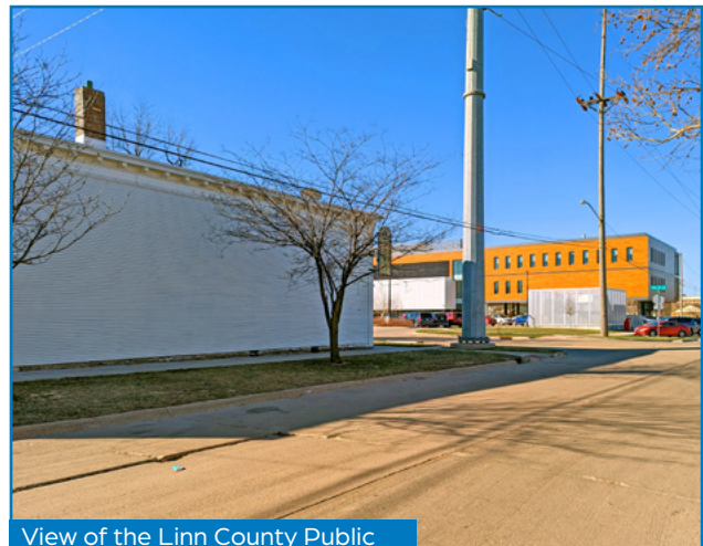
View of the Linn County Public Health Building from 10th Ave SE