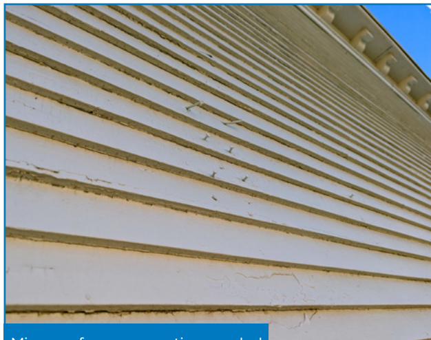
Minor surface preparation needed