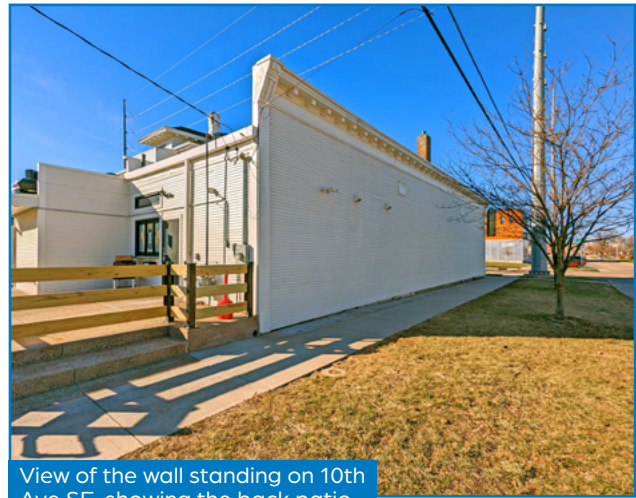
View of the wall standing on 10th Ave SE, showing the back patio